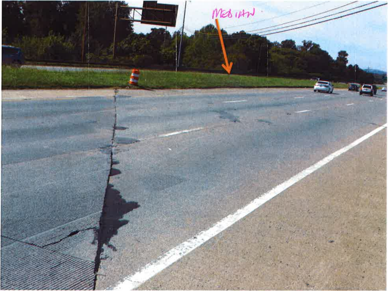
BRIDGE OVER BRADDFORDB AVE. (MEDIAN)