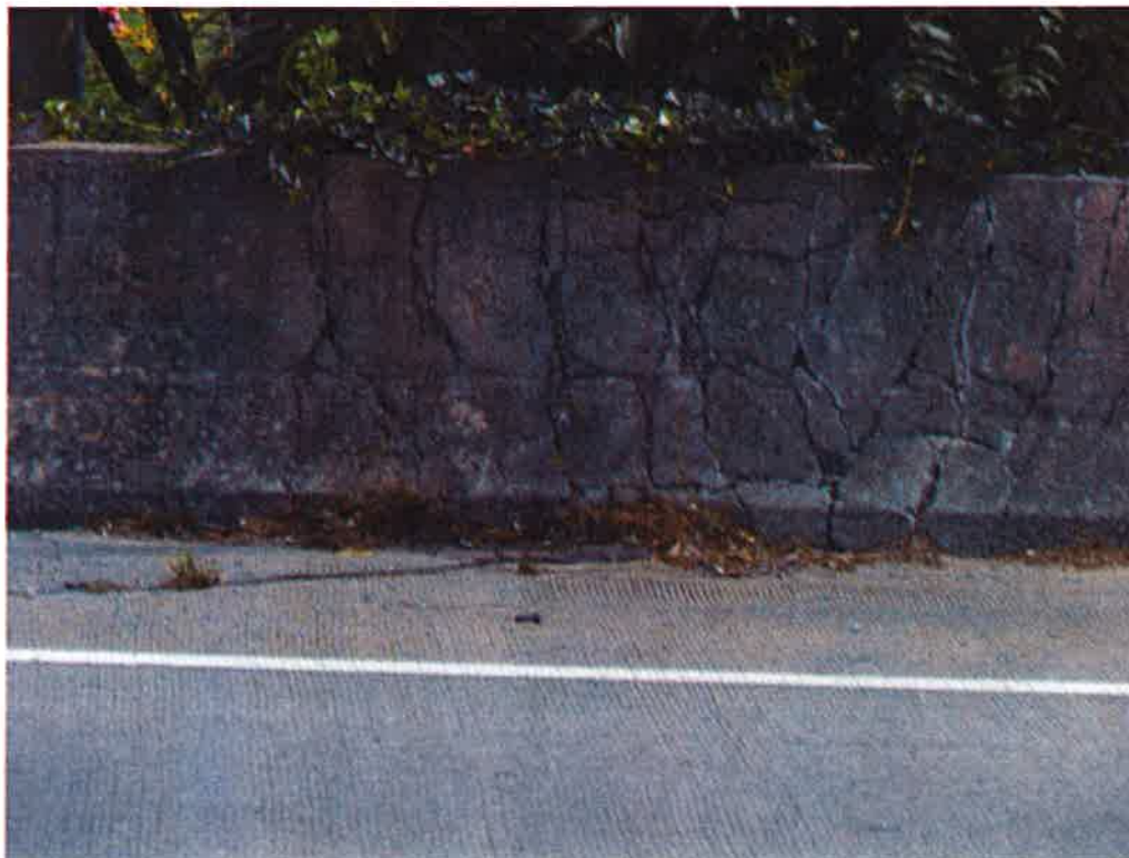
Pic. #39 Right Side Bridgerail @ Abut. #1; Bridge No. 19-I440-5.44