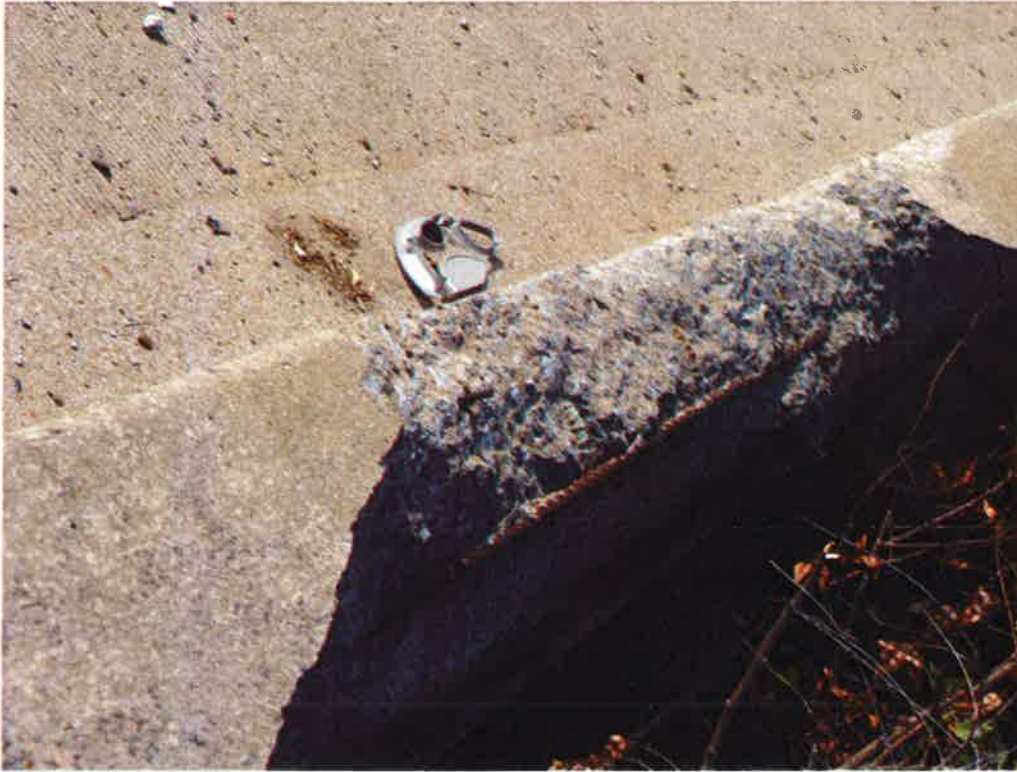
Pic # 19 Breakout about 10' long Left Bridge Rail